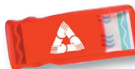
Plastic Bandage Holders