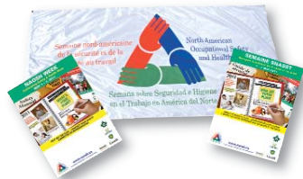
Flags & Posters

We can customize NAOSH Week products for you! Contact CSSE for more information.