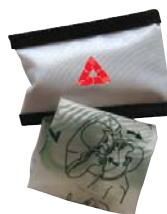
Pocket CPR Mask & Gloves