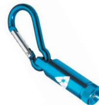
LED Pocket Flashlights