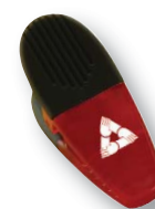
Magnet with Clips

Use the order form on page 15 to order your products TODAY! Or order on-line at: www.csse.org