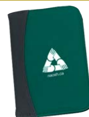
Portfolios 6" x 9"